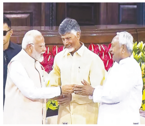
On June 26, the process to elect the Lok Sabha Speaker will see Prime Minister Narendra Modi propose the name of the NDA candidate. This motion is expected to be seconded by senior minister Rajnath Singh. Similarly, the INDI alliance candidate for the Lok Sabha Speaker post will also be proposed. "All our alliance partners will be proposers for the post of the Lok Sabha

But before the election of the Lok Sabha Speaker takes place, there is going to be the post of a Protem Speaker who will preside over the House for the first three days till the Speaker is elected. The general practice for giving this post has been to make the senior most member as the Protem Speaker. Government sources have also told News18 that leaders will reach out to all political parties, including the opposition to elect the Speaker by consensus. The numbers are comfortable as far as the NDA candidate is concerned. Union Defence Minister and Deputy Leader of the Lok Sabha, Rajnath Singh, will reach out to all political parties to seek consensus. Very recently, the newly appointed Parliamentary Affairs Minister Kiren Rijju met with the Leader Of opposition in Rajya Sabha and Congress President Mallikarjun Kharge.