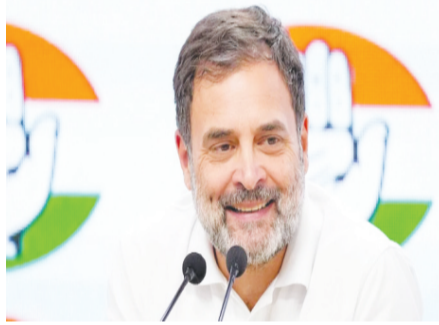
Kharge said of Gandhi.

New Delhi: Birthday wishes poured in for Rahul Gandhi as he turned 54 on Wednesday with Congress president Mallikarjun Kharge saying that his qualities of unwavering commitment to the values espoused in the Constitution and his emphatic compassion for the millions of unheard voices set him apart. Gandhi, a former Congress president and MP from Raebareli, has instructed all Congress workers to avoid any grand celebrations, and instead celebrate this occasion by engaging in humanitarian efforts and charity. "Your unwavering commitment to the values espoused in the Constitution of India and your emphatic compassion for the millions of unheard voices, are the qualities which sets you apart,"