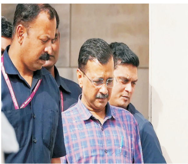
Directorate (ED) sought time to file a reply in the matter. The judge, meanwhile, fixed for Saturday, an application filed by Kejriwal seeking