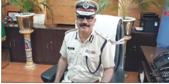
Ranchi