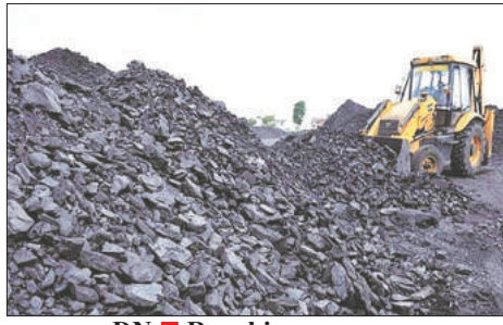
DN ■ Ranchi

Jharkhand's Mines Department has recovered royalty of Rs 10,400 crore from minerals in the financial year 2023-24. Earlier, Rs 9798.40 crore was recovered in financial year 22-23, Rs 7477.41 crore in 21-22, Rs 4888.36 crore in 20-21, Rs 5165.82 crore in 19-20 and Rs 5974.34 crore in 18-19.