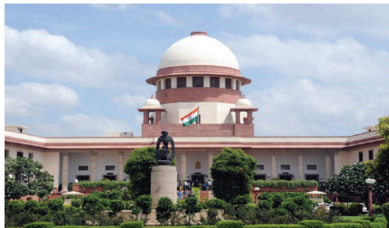
The UGC-NET's cancellation in June further amplifies concerns. The Ministry of Education's suo motu action based on undisclosed inputs from the Union Home

MANY weeks of student trauma later, the Supreme Court verdict on Tuesday finally shut the door on the NEET controversy with a firm rejection of the demand for a re-exam. While the SC decision to avoid a re-test, considering the disruption it would cause to 24 lakh aspirants, is pragmatic, it also highlights deeper issues within our educational and testing systems. Chief Justice DY Chandrachud's observation that the leaks did not constitute a 'systemic breach' provides temporary relief but does little to address the underlying vulnerabilities. The leaks in Hazaribagh and Patna, as per the evidence presented by the National Testing Agency (NTA) and IIT-Delhi question the integrity of an exam critical for aspiring medical professionals. The court's reliance on the NTA to address the affected students' cases reflects a stopgap approach rather than a long-term solution.