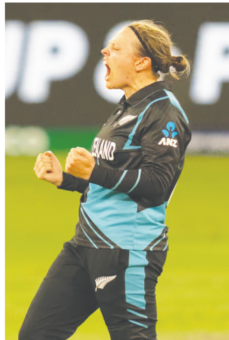
about cricket and knew how to prepare, she started to find that knack of preparing herself