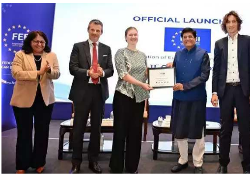
संघीय मंत्री पीयूष गोयल और उनके दल के सदस्यों का आधिकारिक शूभारंभ समारोह की शुरुआत करते हुए।

करने में एक सुविधाकर्ता के रूप में कैसे कार्य कर सकता है, जिससे शूभारंभ के अवसर पर उद्योग और ईयू के प्रतिनिधियों को संबोधित करके हुए कहा कि कुछ इस्पात उत्पादों पर ईयू के सुरुक्षा उपाय भी तर्कहीन हैं। उन्होंने अपने संबोधन में कहा कि हमारे देश में व्यापार, निवेश और विनिर्माण क्षेत्रों में अवसरों की भरमार है। उन्होंने कहा कि कुछ इस्पात उत्पादों पर ईयू के सुरुक्षा उपाय भी तर्कहीन हैं।