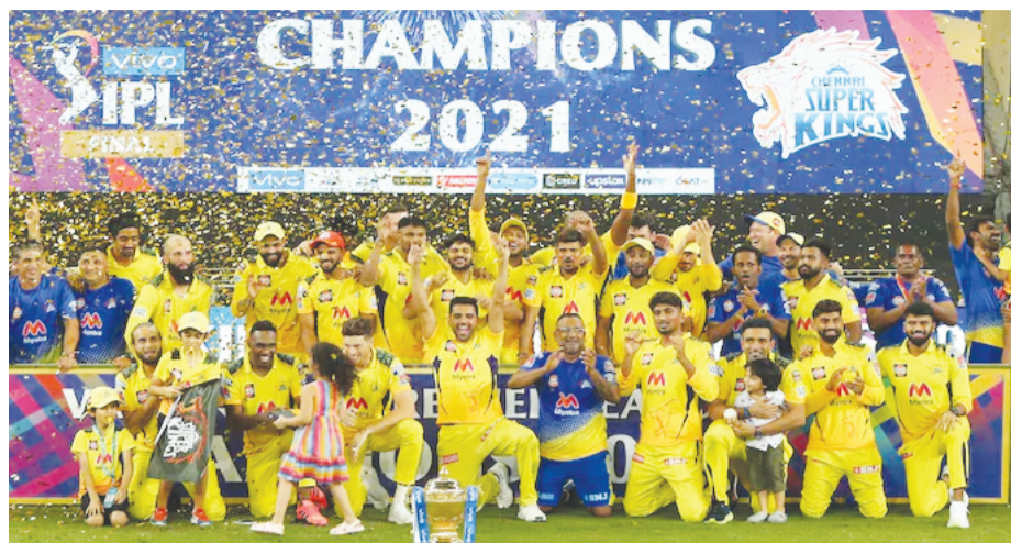
↳ Chennai Super Kings scripted their redemption by winning their 4th IPL title in Dubai. The MS Dhoni-led side beat Eoin Morgan's KKR in the final by 27 runs.

New Delhi. On this day in 2021, Chennai Super Kings lifted their fourth IPL trophy, defeating Kolkata Knight Riders by 27 runs in the final held in Dubai. It was a moment of redemption for MS Dhoni's men, who bounced back after missing out on the playoffs in the previous season. CSK's consistent performances throughout IPL 2021 were capped off by an impressive win in the final, with young opener Ruturaj Gaikwad playing a pivotal role in their success during that particular season with a century and four fifties. Batting first, CSK posted a daunting total of 192/3. Faf du Plessis led the charge with a brilliant 86 off