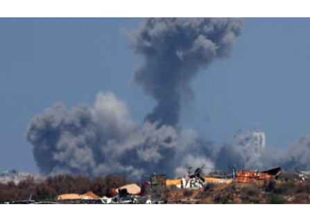
Reuters could not immediately verify, showed dozens of Palestinian men sitting on the ground next to a tank, while others were led by a soldier to a gathering site. Residents and medical officials said Israeli forces were bombing houses and besieging hospitals, preventing medical and food supplies from