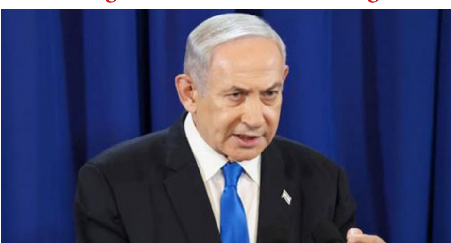
will bring our hostages home from Gaza; and we will return our citizens who live on our northern border safely to their homes." The drone incident occurred shortly after

Tel Aviv: Israeli Prime Minister Benjamin Netanyahu has delivered a pointed warning to Hezbollah in the wake of an attempted drone attack on his residence, calling the incident a "grave mistake." The attack is seen as an alleged assassination attempt against both Netanyahu and his wife, prompting a strong response from the Israeli leader. In a post on X (formerly Twitter) on Saturday, Netanyahu described Hezbollah as "Iran's proxy" and emphasized that such actions will not dissuade Israel from its commitment to combat threats to its citizens. "The attempt by Iran's proxy Hezbollah to assassinate me