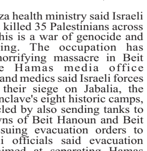
the day, the Gaza health ministry said Israeli military strikes killed 35 Palestinians across the enclave. "This is a war of genocide and ethnic cleansing. The occupation has conducted a horrifying massacre in Beit Lahiya," the Hamas media office said. Residents and medics said Israeli forces had tightened their siege on Jabalia, the largest of the enclave's eight historic camps, which it encircled by also sending tanks to the nearby towns of Beit Hanoun and Beit Lahiya and issuing evacuation orders to residents. Israeli officials said evacuation orders were aimed at separating Hamas fighters from civilians and denied there was any systematic plan to clear civilians out of Jabalia or other northern areas. In Jabalia, residents said Israeli forces besieged several shelters housing displaced families before they stormed them and detained dozens of men. Footage on social media, which