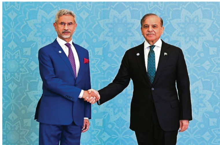
challenge for successive Indian governments.

THE go-ahead to the first visit by an Indian External Affairs Minister to Pakistan in almost nine years was indication enough that behind-the-scenes diplomacy had been productive. Before going to Islamabad to attend a conclave of the Shanghai Cooperation Organisation, S Jaishankar had declared that India's Pakistan policy was not passive. New Delhi, the message went, was willing to respond to any positive gestures. In the Pakistan capital, he said activities characterised by the three evils of terrorism, extremism and separatism would not encourage trade, energy flows, connectivity and people-to-people exchanges. Strong words, but minus the hostility that matter-of-factly manifests itself in any forum that includes India and Pakistan. The resumption of dialogue may not be on the cards, but Jaishankar's informal interaction with his Pakistani counterpart Ishaq Dar raises hopes of ending the deep freeze in bilateral relations. Sustaining even a limited engagement with Pakistan has remained a