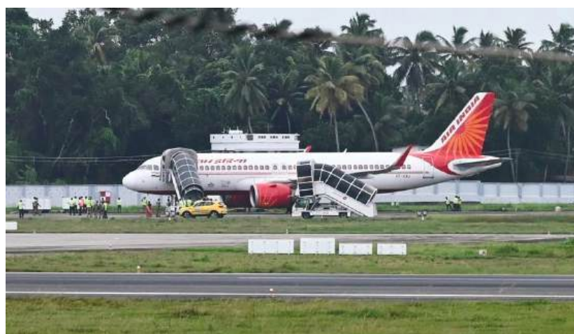
The recurring nature of such threats is a matter of grave concern. It's not just airlines; in recent months, several

THE dramatic surge in hoax bomb threats targeting Indian airlines is testing the robustness of the civil aviation sector. In the past few days, scores of flights — domestic and international — have received threats that later turned out to be hoax calls. Diversions and delays have resulted in widespread disruption in flight schedules as well as significant losses for the airlines. With the use of virtual private networks complicating the tracking process, the Central agencies have a task at hand to get to the perpetrators. Some threatening posts, it is suspected, originated from the UK and Germany. Recently, the Mumbai Police detained a teenager from Chhattisgarh in connection with threats to three flights. Reassurances of safety of passengers and flight protocols being in place cannot sidestep the issue of holding the hoax callers accountable. They must not go unpunished.