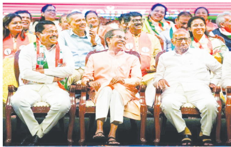
the Shiv Sena (Eknath Shinde faction) and Ajit Pawar-led NCP.

MAHA Vikas Aghadi (MVA) vs Mahayuti — the big battle is between two alliances in poll-bound Maharashtra, but there are some small battles being fought within both camps. The prolonged deliberations on seat-sharing among the MVA constituents — the Congress, the NCP (Sharad Pawar faction) and the Uddhav Thackeray-led Shiv Sena (UBT) — have seen each of them vigorously seeking a bigger piece of the pie. A compromise formula of 85-85-85 for 255 of the 288 constituencies has been worked out, with some of the remaining seats set to be allocated to smaller allies such as the Samajwadi Party, AAP and Left parties. It is evident that the Congress and Uddhav's Shiv Sena have moderated their ambitions and settled for contesting less than 100 seats each. Their climbdown has helped in resolving the stalemate days ahead of the deadline for the filing of nominations. This augurs well for the MVA, which is looking to upstage the ruling Mahayuti alliance comprising the BJP,