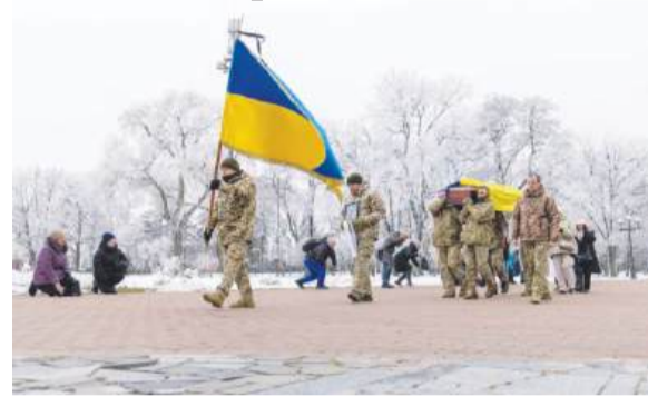
Zelenskyy has been hearing concerns from allies in other Western capitals as well that Ukraine has a troop level problem and not an arms problem, according to European officials who requested anonymity to discuss the sensitive diplomatic conversations. The European allies have stressed that the lack of depth means that it may soon become untenable for Ukraine to continue to operate in Russia's Kursk

to Kyiv before Biden leaves office in less than months. But with time running out, the Biden White House is also sharpening its viewpoint that Ukraine has the weaponry it needs and now must dramatically increase its troop levels if it's going to stay in the fight with Russia. White House National Security Council spokesman Sean Savett in a statement said the administration will continue sending Ukraine weaponry but believes "manpower is the most vital need" Ukraine has at the moment. "So, we're also ready to ramp up our training capacity if they take appropriate steps to fill out their ranks," Savett said. The Ukrainians have said they need about 160,000 additional troops to keep up with its battlefield needs, but the U.S. administration believes they probably will need more than that. More than 1 million Ukrainians are now in uniform, including the National Guard and other units. Ukrainian President Volodymyr