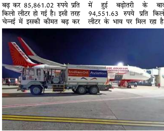
95,231.49 रुपये प्रति किलो लीटर हो गई है, जबकि कोलकाता में एविएशन टर्बाइन फ्यूल की कीमत 84,642.91 रुपये से बढ़ कर 85,861.02 रुपये प्रति किलो लीटर हो गई है। इसी तरह चेन्नई में इसकी कीमत बढ़ कर 94,551.63 रुपये प्रति किलो लीटर के भाव पर मिल रहा है।

एजेंसी नई दिल्ली। सार्वजनिक क्षेत्र की ऑयल मार्केटिंग कंपनियों ने एयर टर्बाइन फ्यूल एटीएफ यानी जेट फ्यूल की कीमत में बढ़ोतरी कर दी है। जेट फ्यूल की कीमत में लगातार दूसरे महीने बढ़ोतरी की गई है। आज जेट फ्यूल की कीमत में 1.45 प्रतिशत का इजाफा किया गया है। कीमत में की गई इस बढ़ोतरी के बाद दिल्ली में जेट फ्यूल की कीमत में 1,318.12 रुपये प्रति किलो लीटर की बढ़ोतरी हो गई है। अब दिल्ली में जेट फ्यूल 91,856.84 रुपये प्रति किलो लीटर के भाव पर मिल रहा है। आज की बढ़ोतरी के बाद मुंबई में एविएशन टर्बाइन फ्यूल की कीमत 84,642.91 रुपये से बढ़ कर 85,861.02 रुपये प्रति किलो लीटर हो गई है। इसी तरह चेन्नई में इसकी कीमत बढ़ कर 94,551.63 रुपये प्रति किलो लीटर के भाव पर मिल रहा है।