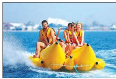
काला पत्थर बीच

है। फोटोशूट के लिए यह बीच एकदम परफेक्ट है तो यदि आप अंडमान जाएं तो इस बीच पर फोटो खिंचवाना न भूलें।