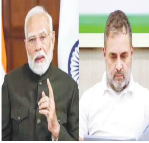
Attack. Congress chief Mallikarjun Kharge and Lok Sabha Leader of Opposition Rahul Gandhi also paid the floral tributes. The tributes reminded everyone about the horrific terror attack on the Indian Parliament on December 13, 2001.

The perpetrators belonged to Lashkar-e-Taiba (LeT) and Jaish-e-Mohammed (JeM)-- two Pakistan-raised terrorist organisations-- attacked the Parliament on December 13, 2001.