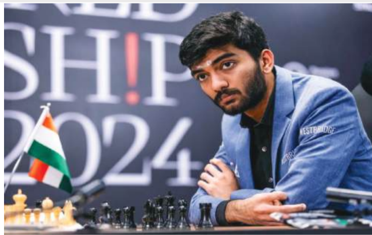
game of chess that won. Gukesh's victory signals a generational shift in the chess

IT'S been Gukesh Dommaraju's year. In September, he led the Indian team to a historic gold medal at the biennial Chess Olympiad. Now, the 18-year-old prodigy from Chennai has fulfilled a childhood dream by becoming the youngest world champion in chess history. He is the first Indian to hold the title after Vishwanathan Anand. Twists and turns marked the 14 games in Singapore. Gukesh and China's Ding Liren, the reigning champ, were tied with two wins each before the final game. Just when a draw seemed imminent, setting the stage for high-speed games to break the tie, Ding committed a dramatic blunder. He was gracious in defeat, marking the end of the three-week match that kept fans riveted across the globe. Former world champions Magnus Carlsen and Vladimir Kramnik may have criticised the quality of play, but in the larger scheme of things, it's the