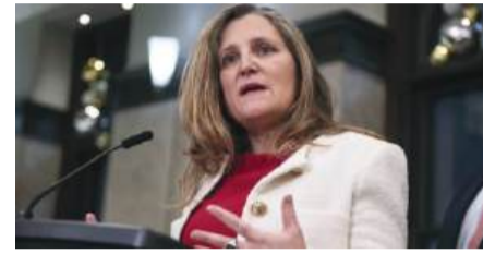
Trump's threat to impose sweeping 25% tariffs and should eschew "costly political gimmicks" it can "afford."

"For the past number of weeks, you and I have found ourselves at odds about the best path forward for Canada," Freeland said. Freeland warns against 'costly political gimmicks' Freeland and Trudeau disagreed about a two-month sales tax holiday and 250 Canadian dollar ($175) checks to Canadians that were recently announced. Freeland said Canada is dealing with