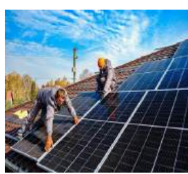
लागाए जा चुके हैं। सरकार का लक्ष्य अगले तीन वर्षों में 25 लाख सोलर रूफटॉप पैनल लगाने का है। योजना को जनता तक पहुंचाने में मिली सफलता का अंदाजा इस बात से लगाया जा सकता है कि अब तक 18 लाख से अधिक पंजीकरण हो चुके हैं, जिनमें से 32 हजार से अधिक घरों में पैनल का इंस्टालेशन भी पूरा कर लिया गया

एजेंसी लखनऊ। मुख्यमंत्री योगी आदित्यनाथ की अगुवाई में पीएम सूर्य घर योजना को उत्तर प्रदेश में नए आयाम मिल रहे हैं। केंद्र की योजनाओं को प्रदेश के विकास से जोड़ते हुए योगी सरकार ने यूपी को सौर ऊर्जा उत्पादन के क्षेत्र में शीर्ष राज्यों में ला खड़ा किया है। बिजली बचत, आय वृद्धि और हरित ऊर्जा के लक्ष्य को पूरा करने वाली इस योजना से प्रदेश के लाखों घर लाभान्वित हो रहे हैं। प्रदेश सरकार की सक्रियता का ही परिणाम है कि उत्तर प्रदेश, सोलर रूफटॉप इंस्टालेशन के मामले में गुजरात और महाराष्ट्र के बाद देशभर में तीसरे स्थान पर है। अब तक प्रदेश में 53 हजार से अधिक सोलर रूफ टॉप पैनल