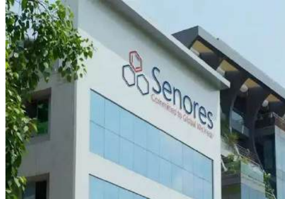
के लिए 75,000 शेयर आरक्षित हैं। कंपनी इस आईपीओ से हासिल राशि का इस्तेमाल अटलांटा सुविधा में

जरूरतों को पूरा करने के लिए किया जाएगा। इसके अलावा एक हिस्सा सामान्य कंपनी कामकाज पर खर्च किया जाएगा। अहमदाबाद स्थित सेनोरेस फार्मास्युटिकल्स लिमिटेड एक वैश्विक शोध संचालित फार्मास्युटिकल कंपनी है। यह कंपनी विभिन्न जटिल फार्मास्युटिकल उत्पादों के विकास और निर्माण में लगी हुई है। इसके अलावा कंपनी अमेरिका, कनाडा और यूनाइटेड किंगडम के विनियमित बाजारों और विभिन्न चिकित्सीय क्षेत्रों और खुरकत रूपों में उभरते बाजारों के लिए ड्रग्स सेगमेंट में जेनेरिक फार्मास्युटिकल उत्पादों की एक विस्तृत श्रृंखला के विकास और निर्माण करती है। कंपनी में प्रमोटर्स की हिस्सेदारी 66.67 फीसदी है, जबकि शेष शेयर सार्वजनिक शेयरधारकों के पास हैं।