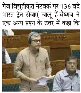
गेज विद्युतीकृत नेटवर्क पर 136 वंदे भारत ट्रेन सेवाएं चालू हैं। वैष्णव ने एक अन्य प्रश्न के उत्तर में कहा कि

एजेंसी नई दिल्ली। रेल मंत्री अश्विनी वैष्णव ने लोकसभा को बताया कि वर्तमान में देश में लंबी और मध्यम दूरी की यात्रा के लिए 10 वंदे भारत स्लीपर ट्रेनों का निर्माण कार्य चल रहा है। उन्होंने कहा कि पहला प्रोटोटाइप निर्मित हो चुका है और इसका फील्ड ट्रायल किया जाएगा। रेल मंत्री ने लोकसभा में एक वक्तव्य में कहा कि इसके अलावा 200 वंदे भारत स्लीपर रेक के निर्माण का काम भी प्रौद्योगिकी भागीदारों को सौंपा गया है। ट्रेन के रोलआउट की समय-सीमा परीक्षणों के सफल समापन पर निर्भर है। 2 दिसंबर तक, देश भर में छेटी और मध्यम दूरी की यात्रा के लिए भारतीय रेलवे के ब्रॉड