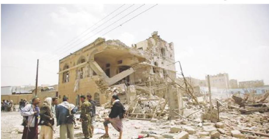
intercepted a missile launched from Yemen before it entered the country's territory. "Rocket and missile sirens were sounded following the possibility of falling debris from the interception," the Israeli military

The Houthis also reported strikes in Hodeida as well. But initial information on the targets of the attack and the timing suggested Israel may have conducted the assault. Houthi-controlled media reported the strikes, but offered no immediate information on casualties nor damage. The Houthi-controlled satellite channel al-Masirah said that some of the strikes targeted power stations in the capital, as well as the Ras Isa oil terminal on the Red Sea. Rebel-held Hodeida, some 145 kilometers (90 miles) southwest of Sanaa, has been key for food shipments into Yemen as its decadal war has gone on. There's also longstanding suspicion that weapons from Iran have been transferred through the port. The strikes happened just after the Israeli military said its air force