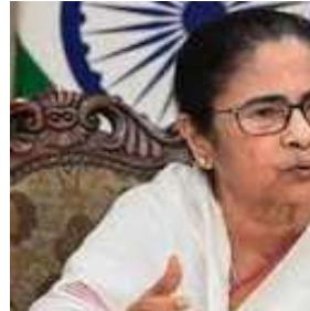
भारत में, बल्कि पूरी दुनिया में विभिन्न क्षेत्रों में अपनी प्रतिभा का प्रदर्शन कर रहे हैं। इस साल राज्य के 45 हजार से अधिक इंजीनियरों ने आईटी कंपनियों में नौकरी हासिल की है। मुख्यमंत्री ने दावा किया कि बंगाल में लगातार बढ़ती मांग, निबंधि बिजली आपूर्ति, उल्कृत कार्य वातावरण और कम उत्पादन लागत जैसे कई लाभ हैं। इसके अलावा, तेज गति वाले इंटरनेट की भी व्यवस्था की जा रही है। उन्होंने

संभाली थी, तब बंगाल में उद्योग और आईटी के लिए अवसर सीमित थे। लेकिन आज स्थिति पूरी तरह बदल चुकी है। बंगाल के युवा न केवल