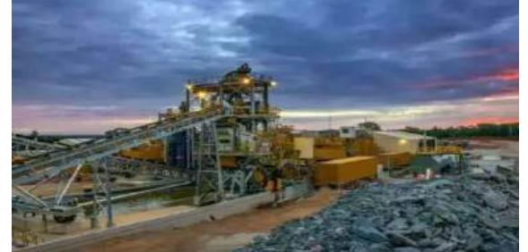
क्रिटिकल मिनरल मिशन का ऐलान इसी साल बजट में किया गया था। दावा किया जा रहा है कि इस मिशन में भारत के क्रिटिकल मिनरल्स इकोसिस्टम को चौतरफा समाधान (360 डिग्री सॉल्यूशन) उपलब्ध करने की कोशिश की गई है। बताया जा रहा है कि नेशनल क्रिटिकल मिनरल मिशन के तहत देश में और दूसरे सहयोगी देशों में लिथियम, कोबाल्ट और निकेल जैसे क्रिटिकल

लिए इंसेंटिव दे सकती है। इसके साथ ही इसमें बैट्री रीसाइक्लिंग के लिए भी इंसेंटिव देने का प्रावधान किया जा सकता है। नेशनल मिशन को लॉन्च करने का ऐलान कर सकती है। देश की एनर्जी सिक्योरिटी और स्टोरेज को लेकर केंद्र सरकार ने इस स्ट्रेटेजिक मिशन को लॉन्च करने की तैयारी की है। बताया जा रहा है कि इस मिशन का ड्राफ्ट तैयार कर लिया गया है और अब इसे मंजूरी के लिए कैबिनेट के सामने पेश किया जाना है। कैबिनेट की मंजूरी मिलने के बाद नेशनल क्रिटिकल मिनरल मिशन को लॉन्च कर दिया जाएगा। ये मिशन 6 साल की अवधि के लिए शुरू किया जाएगा। इस मिशन की शुरुआत होने से इलेक्ट्रिक व्हेकिल सेगमेंट को जबरदस्त बूस्ट मिलने की उम्मीद की जा रही है। केंद्र सरकार की ओर से लॉन्च किए जाने वाले नेशनल क्रिटिकल मिनरल मिशन के लिए प्राथमिक तौर पर 30 हजार करोड़ रुपये का बजट तय किया गया है। इस मिशन के तहत केंद्र सरकार लिथियम, कोबाल्ट और निकेल जैसे क्रिटिकल मिनरल्स के