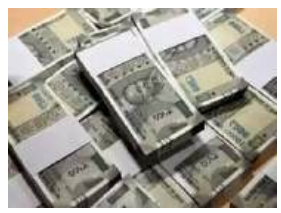
मुताबिक इस अवधि में 40,114 करोड़ रुपये का प्रतिभूति लेन-देन कर (एसटीटी) भी एकत्र किया गया। इस अवधि के दौरान 3.39 लाख करोड़ रुपये के कर रिफंड जारी किए गए हैं, जो सालाना आधार पर 42.49 फीसदी अधिक है। गौरतलब है कि प्रत्यक्ष कर संग्रह में कॉर्पोरेट कर, व्यक्तिगत आयकर और एसटीटी शामिल होते हैं।

एजेंसी नई दिल्ली। चालू वित्त वर्ष 2024-25 में अबतक 17 दिसंबर, 2024 तक शुद्ध प्रत्यक्ष कर संग्रह सालाना आधार पर 16.45 फीसदी बढ़कर 15.82 लाख करोड़ रुपये से अधिक रहा है। केंद्रीय प्रत्यक्ष कर बोर्ड (सीबीडीटी) ने जारी आंकड़ों में बताया कि चालू वित्त वर्ष 2024-25 में एक अप्रैल से लेकर 17 दिसंबर, 2024 तक प्रत्यक्ष कर का कुल संग्रह 15,82,584 करोड़ रुपये (15.82 लाख करोड़ रुपये) रहा है। इस दौरान सकल प्रत्यक्ष कर संग्रह 19,21,508 करोड़ रुपये (19.21 लाख करोड़ रुपये) रहा, जो पिछले साल की समान अवधि के संग्रह की तुलना में 20.32 फीसदी अधिक है। आंकड़ों के मुताबिक इस दौरान अग्रिम कर संग्रह में सालाना आधार पर 21 फीसदी की बढ़ोतरी दर्ज की गई, यह 7.56 लाख करोड़ रुपये हो गया है। सीबीडीटी के अनुसार कुल कर संग्रह में 7.42 लाख करोड़ रुपये से अधिक का कॉर्पोरेट कर और 7.97 लाख करोड़ रुपये का गैर-कॉर्पोरेट कर संग्रह भी शामिल है। आंकड़ों के मुताबिक इस अवधि में 40,114 करोड़ रुपये का प्रतिभूति लेन-देन कर (एसटीटी) भी एकत्र किया गया। इस अवधि के दौरान 3.39 लाख करोड़ रुपये के कर रिफंड जारी किए गए हैं, जो सालाना आधार पर 42.49 फीसदी अधिक है। गौरतलब है कि प्रत्यक्ष कर संग्रह में कॉर्पोरेट कर, व्यक्तिगत आयकर और एसटीटी शामिल होते हैं।