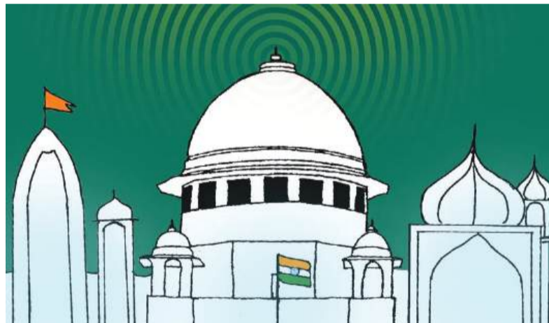
Constitution. The affirmation of the 1991 Act in the Ayodhya judgment of the past.

AT stake is India's secular character and vision as a special Bench of the Supreme Court begins hearing from December 12 a batch of petitions challenging the constitutional validity of the Places of Worship (Special Provisions) Act, 1991. The legislation preserves the identity of religious sites as they stood on August 15, 1947. It also bars suits that seek to alter the status. The hearing comes amid intense judicial activity, particularly in Uttar Pradesh and Rajasthan, in response to multiple civil suits questioning the origins of mosques and dargahs. The petitions in the apex court claim that several mosques have been built on the ruins of temples demolished by invaders. The law, the contention is, denies Hindus and members of other communities the right to reclaim their places of worship. Muslim organisations argue that the law safeguards the basic structure