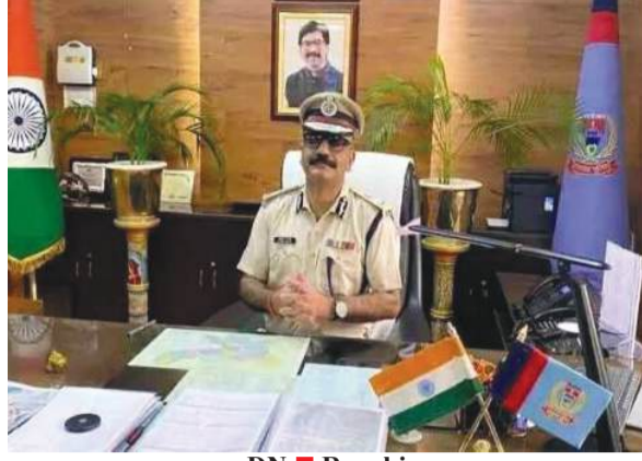
DN ■ Ranchi