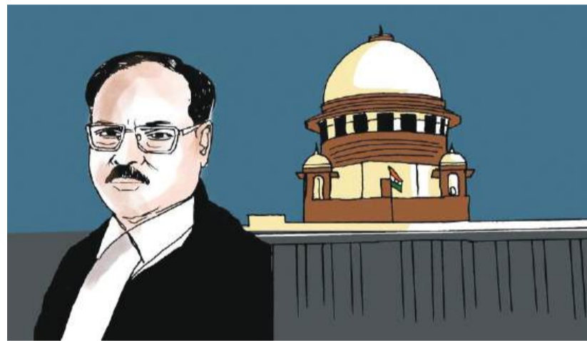
taken oath to uphold these principles making an exhibition