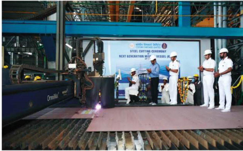
Radars. All key equipment central to the vessel's operations has been indigenously developed and manufactured, highlighting the nation's technological prowess and aligning with the government's Aatmanirbhar Bharat initiative, the ministry stated.

The ships are designed as high-speed vessels, equipped with a powerful array of weapons and sensors, including a Surface-to-Surface Missile System, Anti-Missile Defence Systems, Air Surveillance, and Fire Control