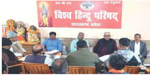
DN ■ Ranchi