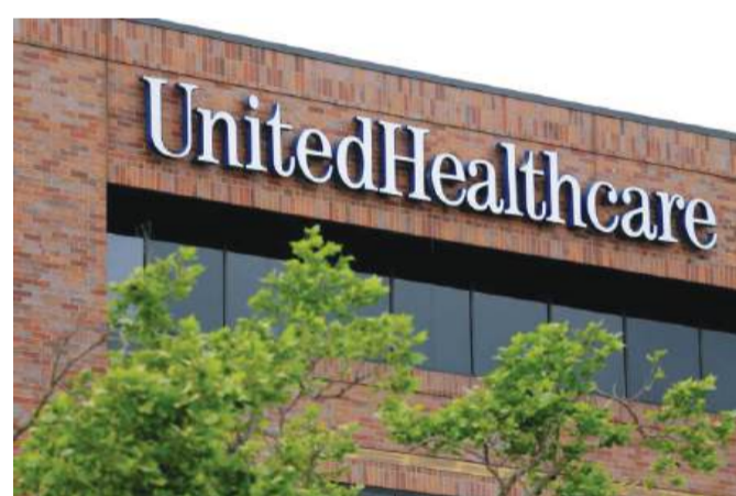
for many middle-class families. This trend undermines public trust and risks turning health insurance into an

THE shocking murder of UnitedHealthcare CEO Brian Thompson in the US, reportedly motivated by grievances over denied claims, has ignited a global debate about health insurance systems. While the US struggles with its own healthcare challenges, India faces a similarly disheartening reality. As per a recent survey, 43 per cent of policyholders in India reported difficulties in claim processing, ranging from rejections due to "pre-existing conditions" to opaque exclusions hidden in fine print. India's health insurance sector, touted as a safety net, often traps patients in a web of delays and financial burdens. Claims are sometimes processed so sluggishly that hospital discharges are delayed, forcing families to bear additional costs. Ambiguous contracts filled with technical jargon only worsen the plight of policyholders, many of whom are left financially and emotionally drained. Adding to the problem, insurance premiums have seen staggering hikes — over 50 per cent for one in five policyholders last year — making coverage unaffordable