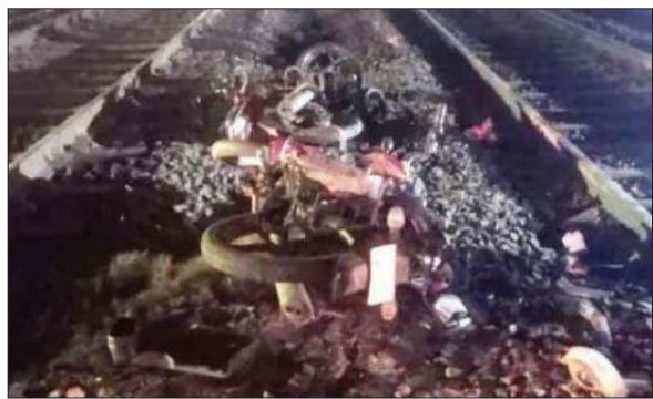
DN ■ Chakradharpur

A horrific rail accident took place near Kalunga station of Chakradharpur Railway Division on Friday, in which three bike riders died on the spot and two people were seriously injured. It is being told that three bikes were hit by a freight train while trying to cross the closed railway gate. The collision was so severe that the bike and the riders were blown to pieces. Three people died on the spot, while two injured were taken to the hospital in critical condition. After this accident, the railway and the administration have appealed to the people not to try to cross the closed railway gates. This incident is once again raising questions about the lack of railway safety and vigilance.