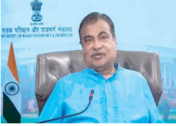
परिवहन मंत्रालय का कार्यभार संभाला था, तब वाहन उद्योग का आकार 7.5 लाख करोड़ रुपये था, जो अब बढ़कर 22 लाख करोड़ रुपये हो चुका है। फाडा के कार्यक्रम को संबोधित करते हुए उन्होंने कहा सरकार और भारत सरकार को जीएसटी के हिस्से के रूप में अधिकतम राजस्व दे रहा है। मंत्री ने बताया कि भारत में निर्मित सभी दोपहिया मोटरसाइकिलों में से 50 प्रतिशत का निर्यात किया जाता है।

दूसरे नंबर पर चीन 47 लाख करोड़ रुपये और भारत 22 लाख करोड़ रुपये का स्थान तीसरे नंबर पर आता है। उन्होंने कहा कि जब 2014 में