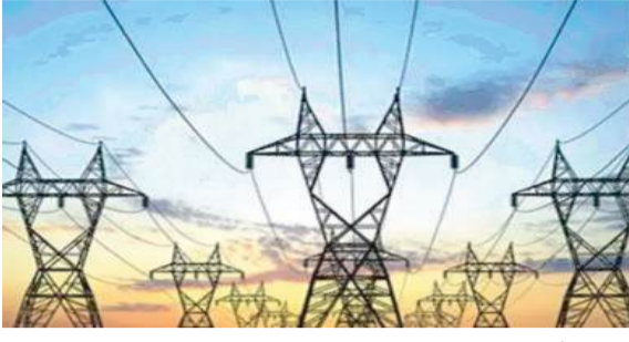
केंद्र के ज्येष्ठ सुविधा प्रदान करने के उपयोगकर्ता और वितरण कंपनी, दोनों को लाभान्वित करते हैं। वहीं, डिस्कॉम को घाटे को कम करने, आदि में मदद करते हैं विद्युत मंत्रालय ने जारी बयान में कहा कि केंद्रीय विद्युत और आवास एवं शहरी कार्य मंत्री मनोहर लाल की अध्यक्षता