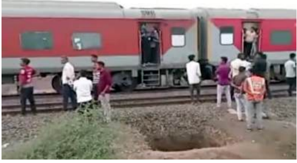
tending the World Economic

Mumbai: At least 11 people were killed on Wednesday after jumping off a train in Maharashtra's Jalgaon district, following rumors of a fire and an impending collision with another train. The incident occurred between Maheji and Pardhade stations, around 400 km from Mumbai.