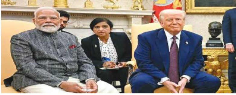
security challenges, reinforcing both nations' commitment to closer cooperation.

A major highlight of the joint statement was the plan to sign a new ten-year framework for the US-India Major Defence Partnership. This agreement aims to strengthen bilateral defence ties amid evolving