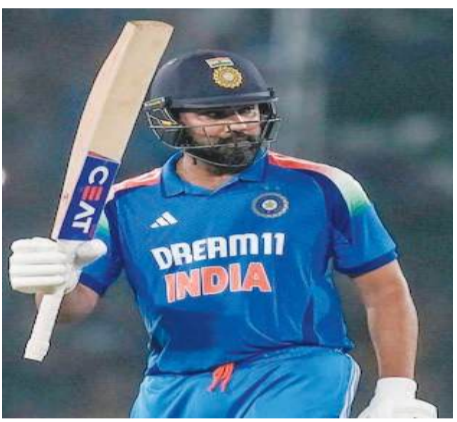
Champions Trophy: Full coverage

New Delhi India captain Rohit Sharma is just 12 runs away from reaching a significant career milestone—completing 11,000 runs in One Day Internationals (ODIs). This landmark moment could arrive in India's much-anticipated Champions Trophy opener against Bangladesh on February 20. If Rohit achieves this feat, he will become only the 10th batter in cricket history and the fourth from India to surpass 11,000 ODI runs, joining the elite company of Sachin Tendulkar, Sourav Ganguly, and Virat Kohli. One of India's most prolific ODI batters, Rohit has played 260 innings so far. If he reaches the milestone in the match against Bangladesh, he will become the second-fastest player to do so, surpassing none other than Sachin Tendulkar, who took 276 innings to achieve the feat. Only his long-time teammate and batting stalwart Virat Kohli has reached the mark quicker, doing so in just 222 innings.