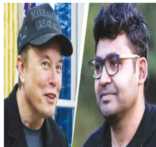
got done last week," Musk posted on X. "Failure to respond will be taken as a

like to provide you with perspective on the level of internal distraction and how it is hurting our ability to do work. I hope the AMA will help people get to know you, to understand why you believe in Twitter, and to trust you- and I'd like the company to get to a place where we are more resilient and don't get distracted, but we aren't there right now." "What did you get done this week?" was Musk's reply in the form of a pertinent question posed to the former Twitter CEO that has returned as a threat to scores of US federal workers three years later. The X user's post was captioned, "DOGE: Almost three years ago Elon Musk asked Parag Agrawal what he got done last week. Now he's asking every federal worker the same question". The X user also shared a grab of Musk's order issued in line with US President Donald Trump's Truth Social post, in which he said that DOGE should be more aggressive in its attempts to downsize and reshape the federal workforce. "All federal employees will shortly receive an email requesting to understand what they