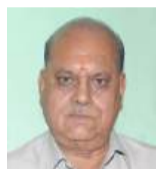
by Ajay Kumar

Lucknow: It is unfortunate that, like the Lok Sabha and Rajya Sabha, the legislative assemblies of many states are becoming battlegrounds for power and opposition struggles, which causes decisions on several public interest issues to be delayed. The situation is such that in Rajasthan, Congress is protesting against the BJP government because a BJP minister referred to former PM Indira Gandhi as 'Dadi' (grandmother). Similarly, in Delhi, leaders of the Aam Aadmi Party are attacking the BJP for not fulfilling their promise of providing ₹2,500 to women, despite the fact that the promise was made four days ago. Meanwhile, in Uttar Pradesh, leaders of the Samajwadi Party are disrupting the legislative assembly because Deputy CM Brajesh