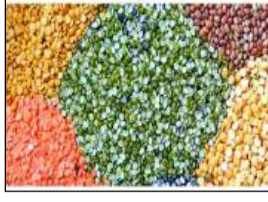
सरसों तेल, सोया रिफाईंड, पाम ऑयल और वनस्पति तेल के भाव में कोई बदलाव नहीं हुआ। सप्ताहांत पर सरसों तेल 15751 रुपये प्रति क्विंटल, मूंगफली तेल 18462 रुपये प्रति क्विंटल, सरसों तेल 16484 रुपये प्रति क्विंटल, सोया रिफाईंड 15457 रुपये प्रति क्विंटल, पाम ऑयल 13187 रुपये प्रति क्विंटल और वनस्पति तेल 16044 रुपये प्रति क्विंटल पर रहा।

एजेंसी नई दिल्ली। विदेशी बाजारों में तेजी रहने के बावजूद स्थानीय स्तर पर मांग कमजोर रहने से बीते सप्ताह दिल्ली थोक जिन बाजार में खाद्य तेलों में टिकाव रहा जबकि दाल और मीठे में मिलाजुला रुख वहीं अन्य जिनसों के भाव स्थिर रहे। तेल-तिलहन : वैश्विक स्तर पर मलेशिया के बुरसा मलेशिया डेरिवेटिव एक्सचेंज में पाम ऑयल का मार्च वायदा सप्ताहांत पर 124 रिगिट उबलकर 4849 रिगिट प्रति टन पर पहुंच गया। इसी तरह मार्च का अमेरिकी सोया तेल वायदा 0.44 सेंट की बढ़ोतरी लेकर 47.03 सेंट प्रति पौंड बढा गया। इस दौरान खाद्य तेलों में टिकाव रहा। सरसों तेल, मूंगफली तेल,