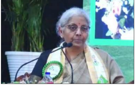
अपनाने को लेकर वित्त मंत्री ने कहा कि 2024 में देश में एआई से जुड़े हुए 3 अरब एप डाउनलोड हुए थे।

एजेंसी कोल्लयम। वित्त मंत्री निर्मला सीतारमण ने भारत में इनोवेशन की तेज गति और आर्टिफिशियल इंटेलिजेंस (एआई) को अपनाने में देश की स्थिति पर प्रकाश डालते हुए कहा कि भारत एआई डाउनलोड्स में चीन और अमेरिका से भी आगे निकला गया है। वित्त मंत्री ने आईआईआईटी कोल्लयम के दीक्षांत समारोह में अपने संबोधन में माइक्रोसॉफ्ट के सीईओ सत्य नडेला के उस बयान जिक्र किया, जिसमें उन्होंने भारत को 'एआई के उपयोग की राजधानी' बताया था। केंद्रीय मंत्री ने कहा कि यह एक 'बहुत बड़ा बयान' है क्योंकि इसका मतलब है कि हम सिर्फ एआई के बारे में बात नहीं कर रहे हैं या केवल एआई में शोध नहीं कर रहे हैं, बल्कि हम इसे बड़े पैमाने पर लागू कर रहे हैं। भारत द्वारा तेजी से एआई को