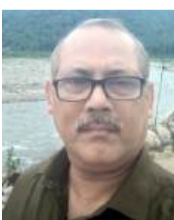
by Nava Thakuria

Guwahati: Press Club of Assam (PCA) expresses worries that the country's statutory and quasi-judicial body to safeguard the press freedom remains non-functional for nearly five months. PCA in a statement insisted on constituting the 15th Press Council (of India) as the term of the 14th Press Council expired on 5 October 2024. It also demanded to empower the PCI bringing the news channels and digital platforms under its jurisdiction and giving a new meaning