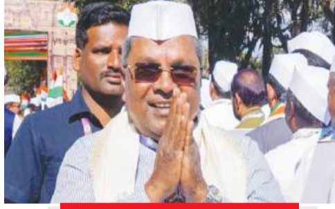
BJP leaders' Lokayukta statements contradict public claims. Muda scam probe reveals no political pressure in site allocation. Siddaramaiah's wife's land deal followed 50:50 policy.

allocation case. Politicians from across party lines, including BJP and JD(S) leaders, gave testimonies that suggest the site allocation to Siddaramaiah's wife, Parvathi, followed standard procedures and was not influenced by political pressure. India Today has exclusively accessed these statements.