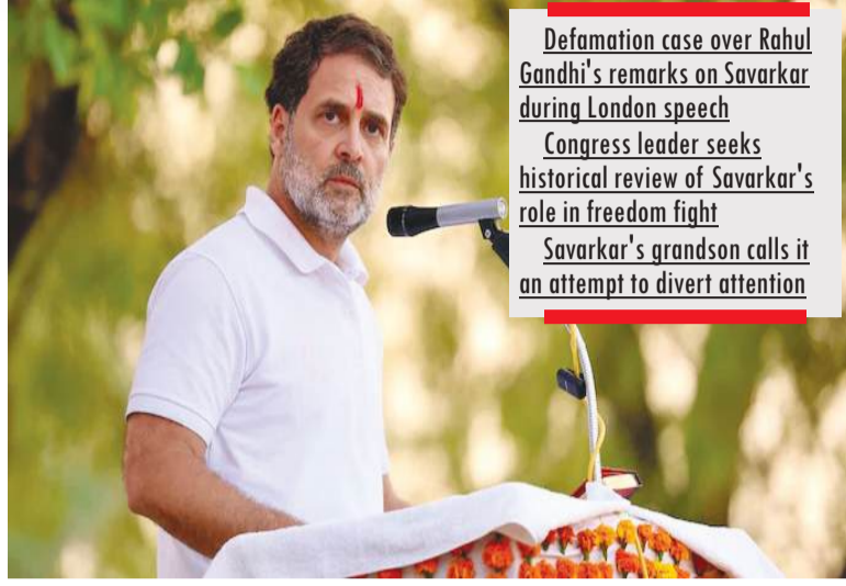
Defamation case over Rahul Gandhi's remarks on Savarkar during London speech Congress leader seeks historical review of Savarkar's role in freedom fight Savarkar's grandson calls it an attempt to divert attention