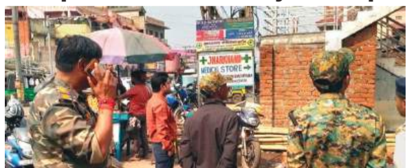
DN ■ Kathara