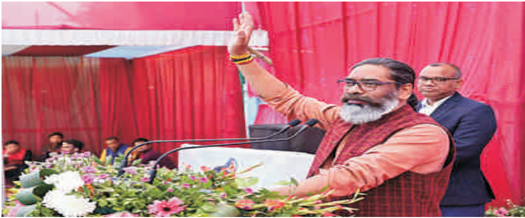
Hemant Soren (File Photo)

Ranchi: Jharkhand Chief Minister Hemant Soren on Friday launched a health insurance scheme for state government employees, aiming to extend the coverage to active and retired ones.