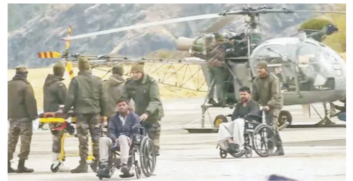
Rescue operations underway in Uttarakhand after avalanche

Officials said 49 labourers have been rescued alive and a search is underway for the remaining five.