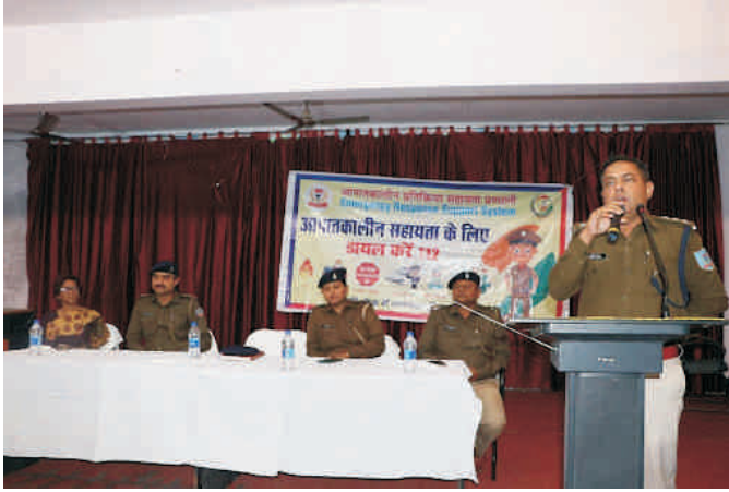
Senior Deputy Superintendent of Police addressing students at a seminar