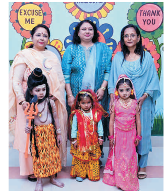
Little Angels Kindergarten Children dressed as Shiv and Parvati on Mahashivratri

Children participated enthusiastically, dressing up in creative costumes related to Lord Shiva and other