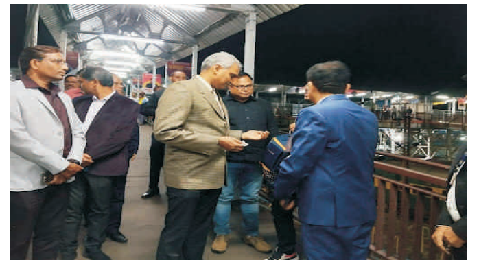
DRM inspecting Dhanbad Railway Station